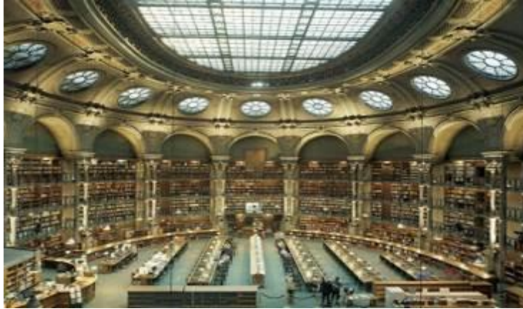
Library of the National Institute for Art History (INHA)