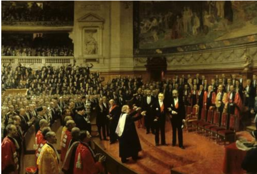
Sorbonne honors Pasteur – 1892

At the cross-roads of tradition and modernity, Panthéon-Sorbonne University is at the forefront of research and teaching in the fields of European studies, international relations, management and communications. It aims to be a major pole of research and learning in Europe in the 21st century.