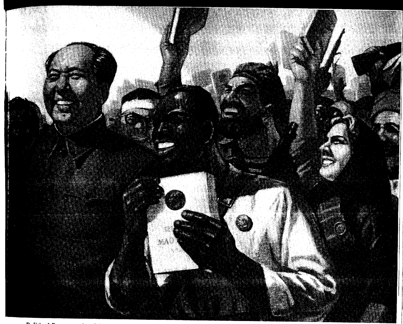
Political Propaganda of the Chinese Revolution. International Visions & Mao.

African Americans. In Harlem in the late 1960s and early 1970s, it seemed as though everyone had a copy of Quotations from Chairman Mao Tse-Tung , better known as the "little red book." From time to time supporters of the Black Panther Party would be seen selling the little red book on street corners as a fund-raiser for the party. And it was not unheard of to see some young black radical strolling down the street dressed like a Chinese peasant—except for the Afro and sunglasses, of course.