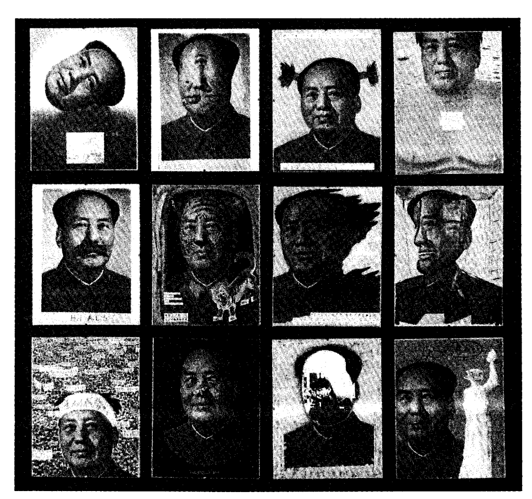
"Chairmen Mao." Mixed media image by Zhang Hong tu.

found in Guangzhou during the twelfth century, and some African students in Communist China complained of racism. (Indeed, after Mao's death, racial clashes on college campuses occurred more frequently, notably in Shanghai in 1979, Nanjing in 1980, and Tianjin in 1986.)13 Furthermore, Chinese foreign policy toward the black world was driven more by strategic considerations than by a commitment to Third World revolutionary movements, especially after the Sino-Soviet split. China's anti-Soviet position resulted in foreign policy decisions that ulti-