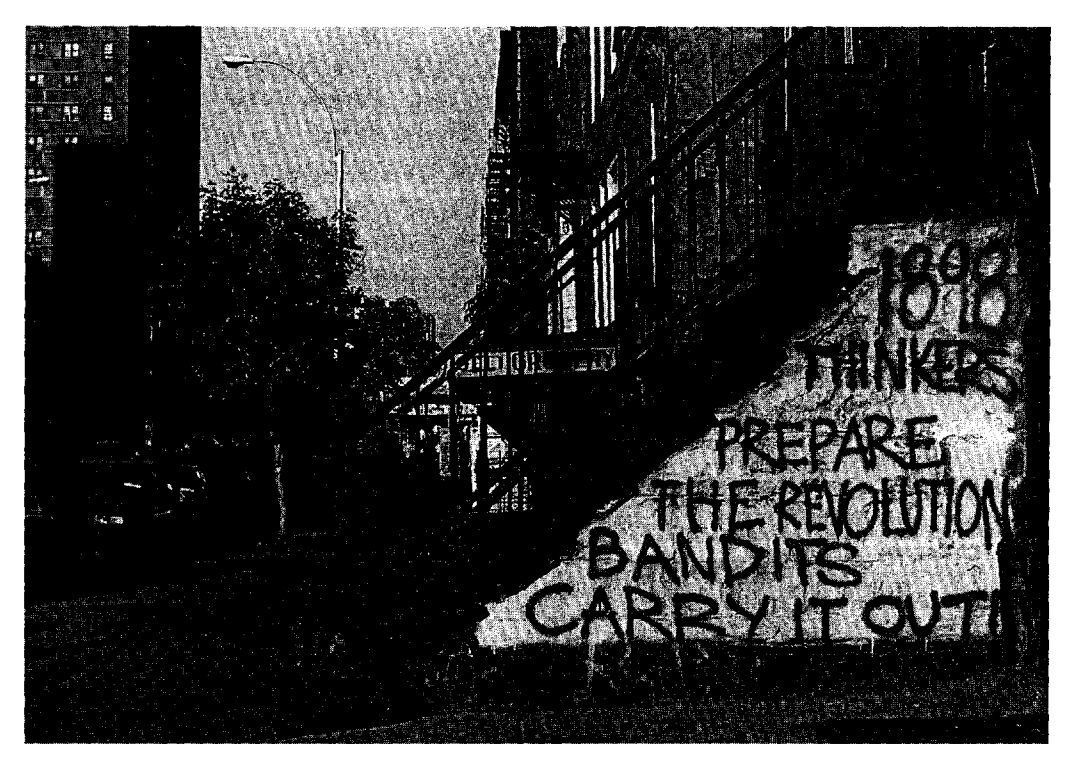
Political Art.

transcend obvious sloganeering ("The foulest intellectual rubbish ever invented by man is that of racial superiority and inferiority," or "A revolutionary fails only if he surrenders.")<sup>92</sup> Many of Nkrumah's insights, however, could have come straight from Mao's pen, particularly those quotations dealing with the need for popular mobilization, the dialectical relationship between thought and action, and issues related to war and peace and imperialism.