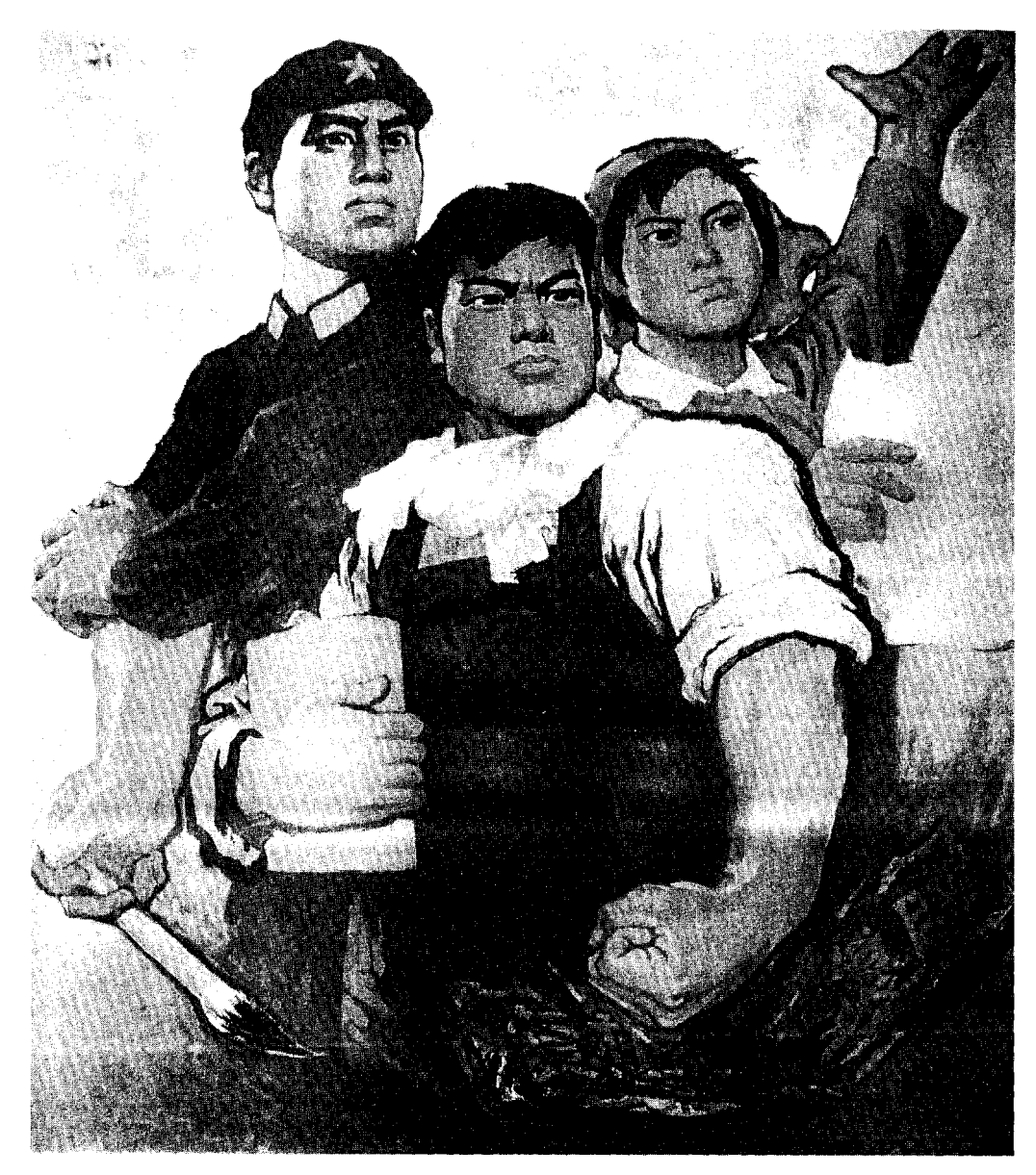
Worker, Peasant, and Soldier. "The People's Art"-Chinese Revolution

explore in this article. At a moment when a group of nonaligned countries sought to challenge the political binaries created by Cold War politics, when African nationalists tried to plan for a postcolonial future, when Fidel Castro and a handful of fatigue-clad militants did the impossible, when Southern lunch counters and Northern ghettos became theaters for a