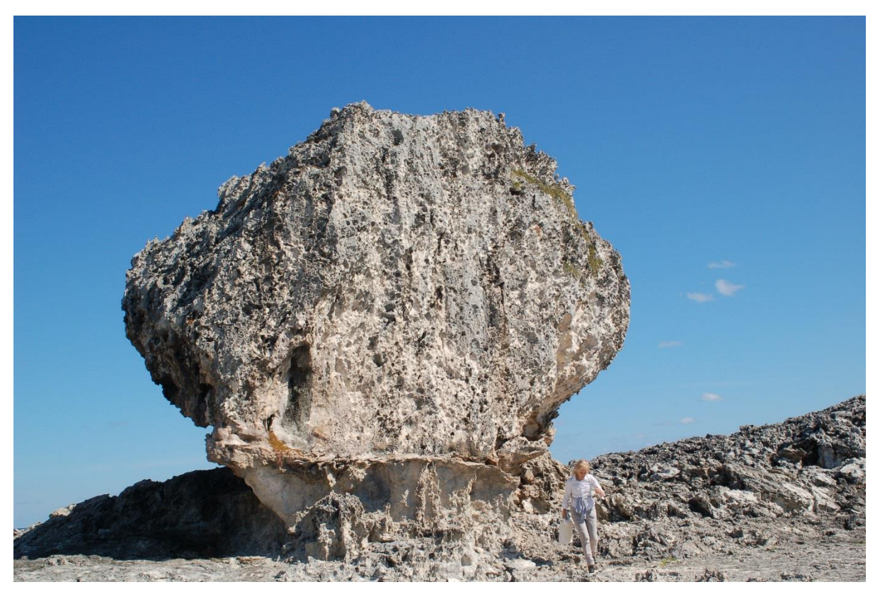
Fig. 1. One of the Hearty boulders, with 1.6 m yardstick walking away from her measuring duty.