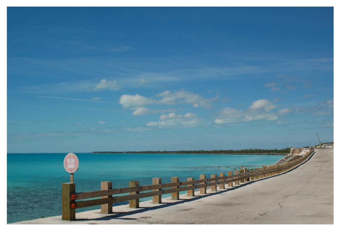
Fig. 3. Looking the other direction, from the road toward the turquoise Caribbean (the bridge and yardstick are at the extreme right)