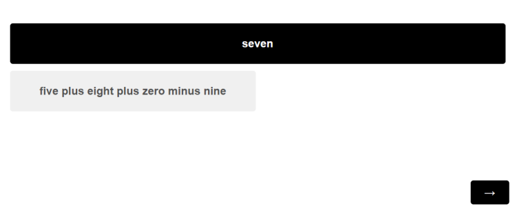
Figure 1: A choice problem comparing one lottery to the default.

Do you want to keep 7 points or switch to another option?