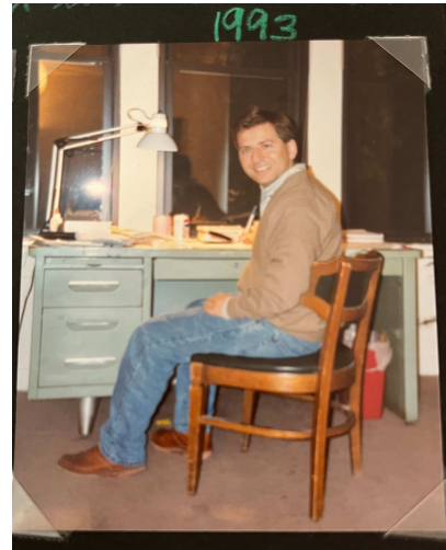
University of Chicago 1993 (desk was a hand-me-down from Econ department)