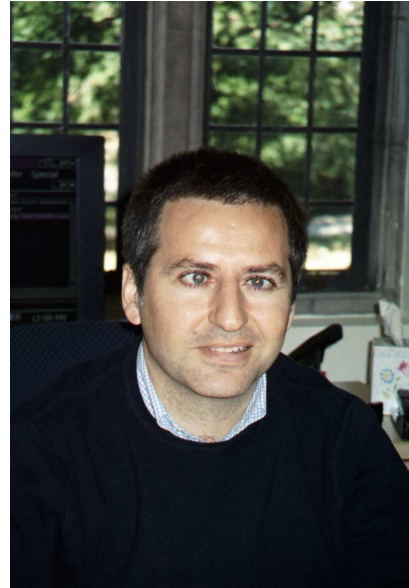
Duke University, 2003