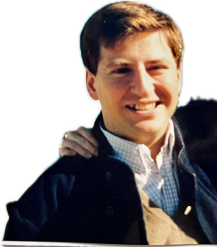
University of Chicago, circa 1991