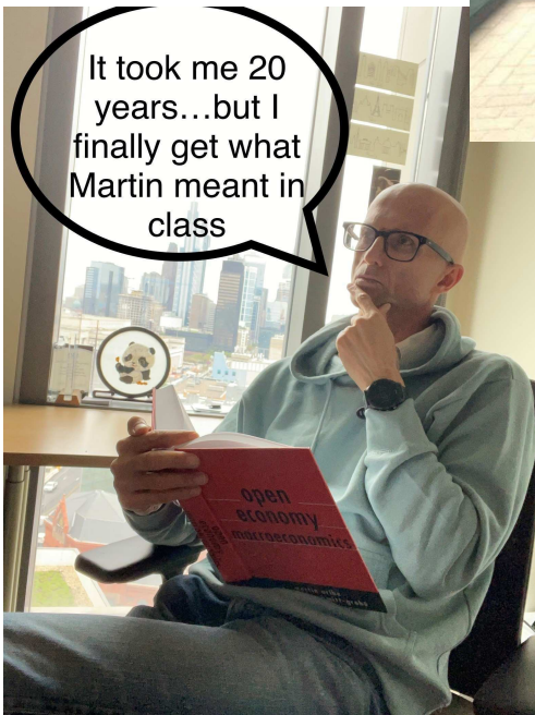
Marco and the open economy macroeconomics textbook