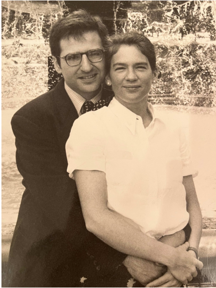
Federal Reserve Board, 1998